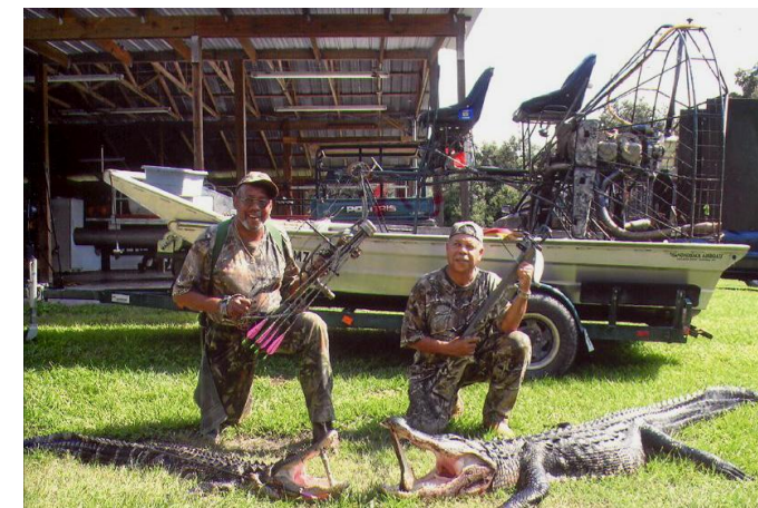
BRADY RANCH SEMINOLE PRAIRIE – WILDLIFE PRESERVE